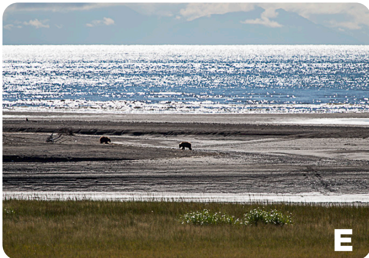
BROWN BEARS ON THE BEACH