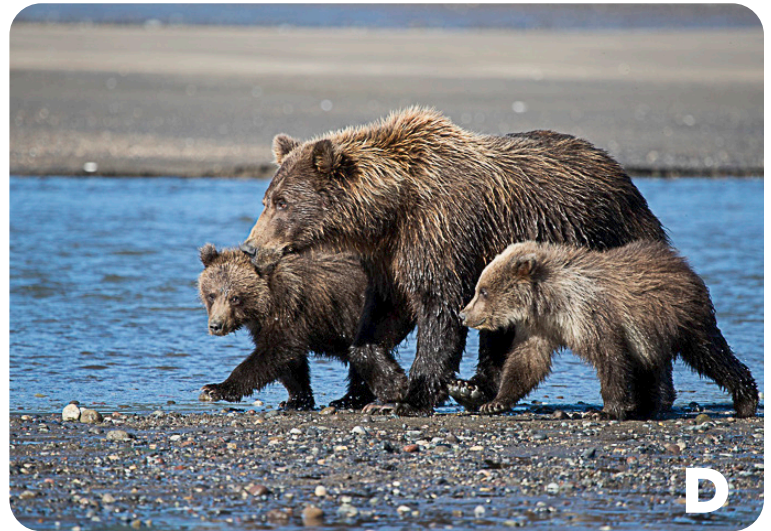
BROWN BEAR FAMILY