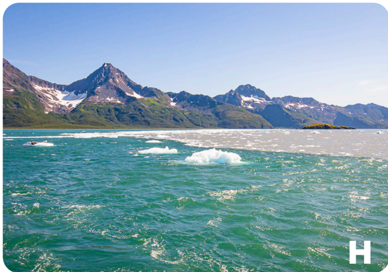
EAST SIDE OF AIALIK BAY