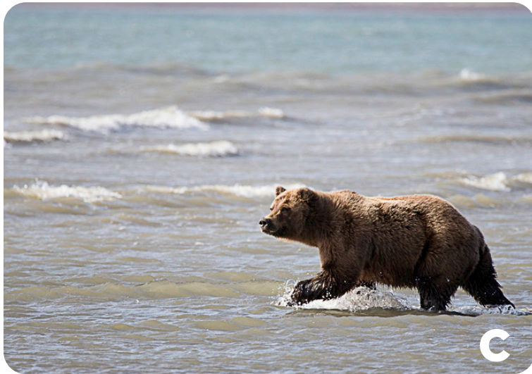
BEAR WADING ON THE BEACH