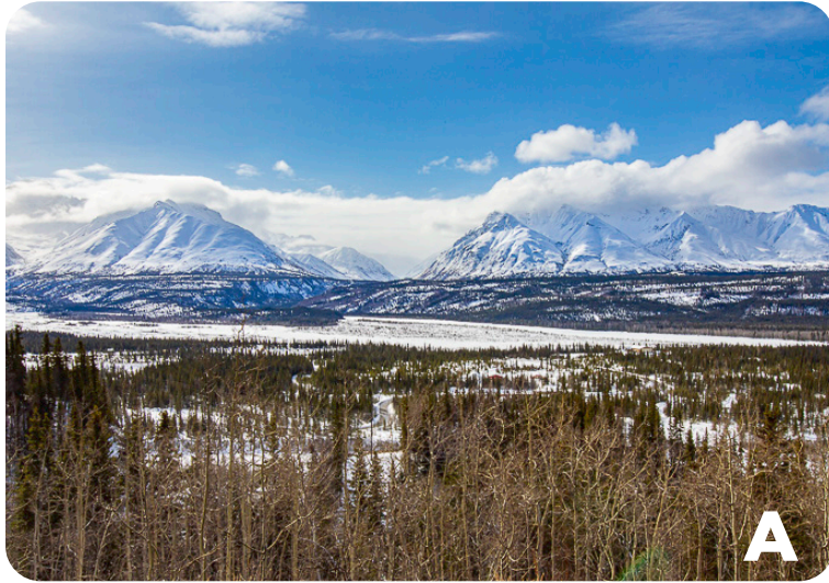
ALASKA RANGE MOUNTAINS