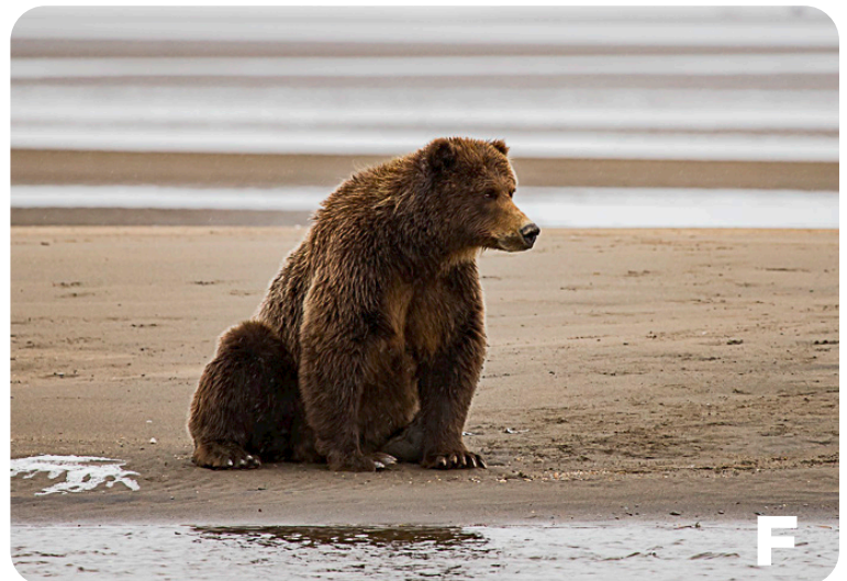
BROWN BEAR FISHING