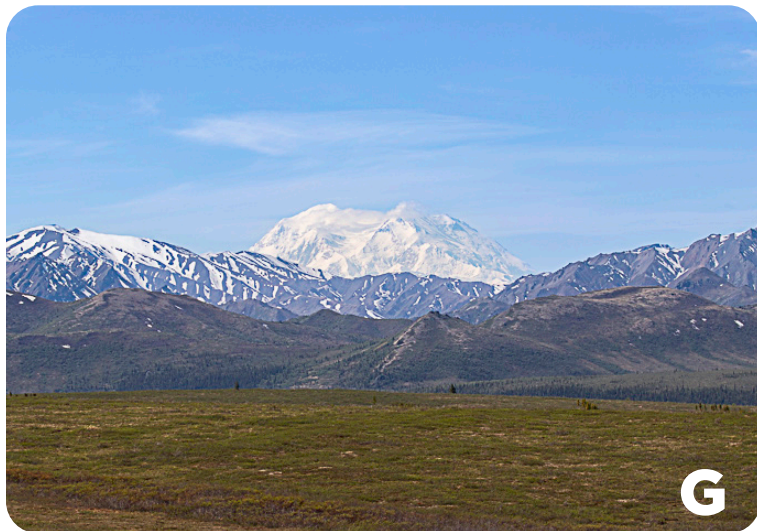
DENALI IN SUMMER